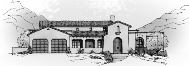
Santa Barbara Ranch with Optional Side Load Garage