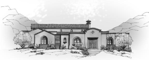
Spanish Colonial with Optional Casita and Optional Side Load