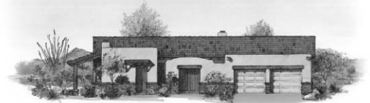
Elevation B Artist's Rendering