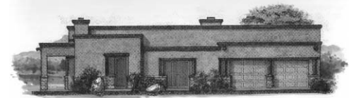
Elevation A Artist's Rendering