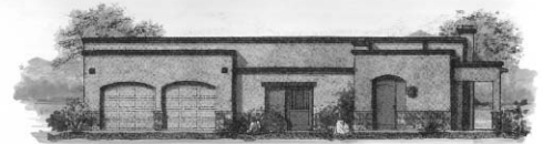
Elevation A Artist's Rendering