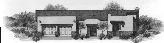
Elevation B Artist's Rendering