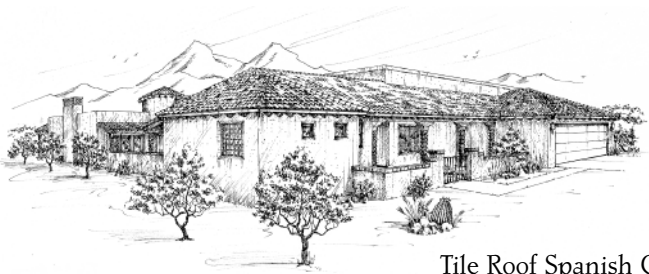
Tile Roof Spanish Colonial