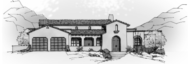
Santa Barbara Ranch with Optional Side Load Garage