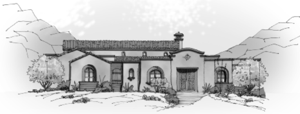
Spanish Colonial with Optional Casita and Optional Side Load