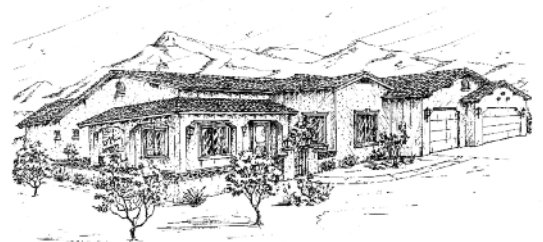
Santa Barbara Ranch