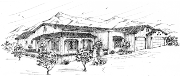
Tile Roof Spanish Colonial