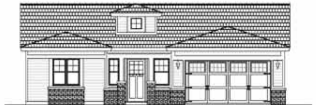
PINEHURST CRAFTSMAN - C

Craftsman architectural exterior on all 4 sides