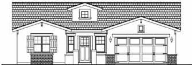
PINEHURST PRAIRIE - D

Craftsman architectural exterior on all 4 sides