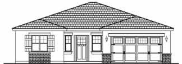
PINEHURST PRAIRIE - E