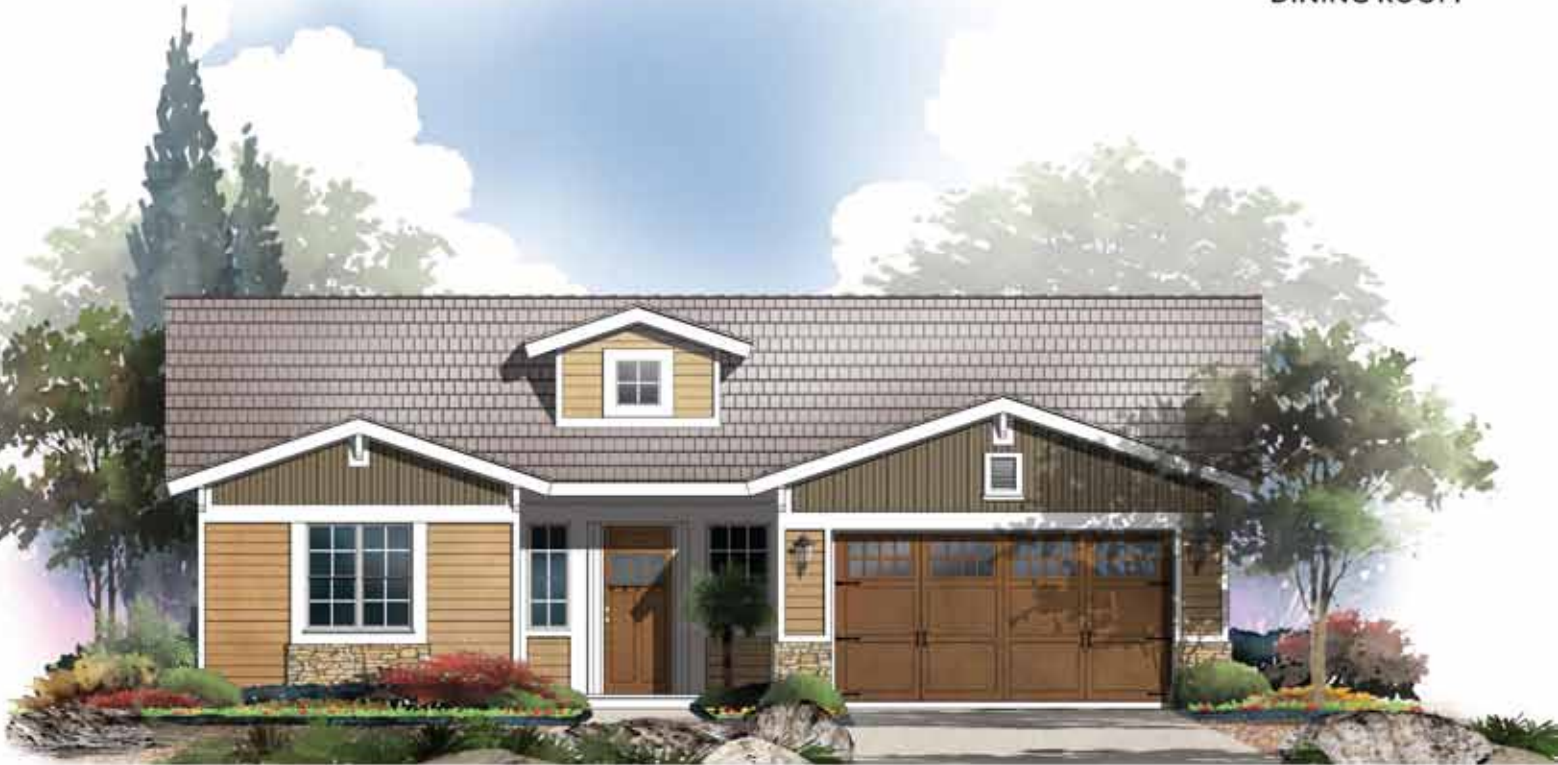
PINEHURST CRAFTSMAN - A