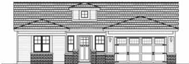
PINEHURST CRAFTSMAN - B