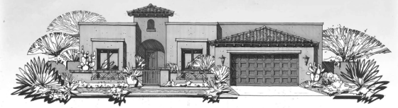
Elevation A Artist's Rendering